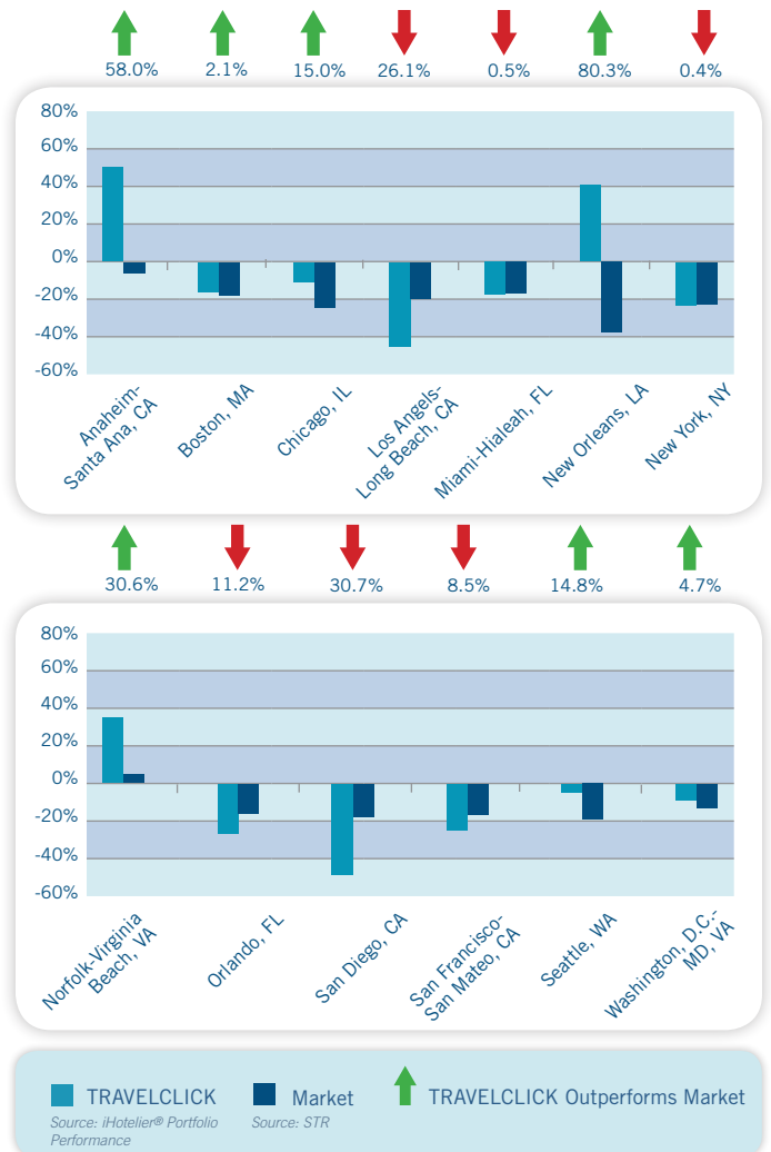
Chart 2. U.S., Top Cities Revenue Percent Change, Month-to-Date.